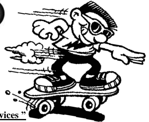
" They All Are Missing Helmets And Safety Devices "